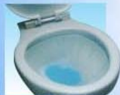
End of flush