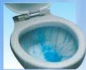
Start of flush